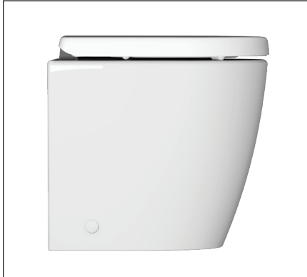
Pictured with Urbane Compact soft close seat

A classic designed wall faced concealed toilet suite comprises the Urbane Compact pan with short projection (460mm) and the trusted Caroma Invisi II cistern to suit small bathroom spaces in domestic and commercial projects. The smooth sided pan matched with the concealed cistern offer a seamless finish to your bathroom. Choose from a variety of buttons from the Caroma range to complete your desired look.